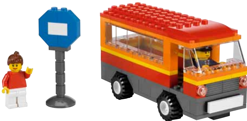
Suggested model solution